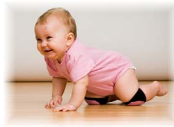
Ages and Stages Questionnaire